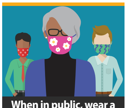
When in public, wear a cloth face covering over your nose and mouth.