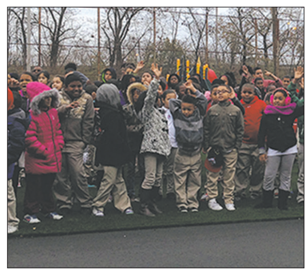
Kids gather to join in celebration of the opening of the new Sussex Avenue Renew School playground.