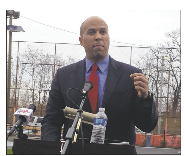
Former Newark mayor Sen. Cory Booker praised the teachers, staff, and children of the school, "who designed and helped to construct this playground."