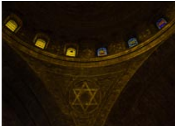
B'nai Jeshurun, Newark NJ

The Grail is guarded by a 1500-year-old knight, and is in a room with many chalices and goblets. Donovan follows the path blazed by Indy to the Grail room, and Donovan wants to be the first person to use