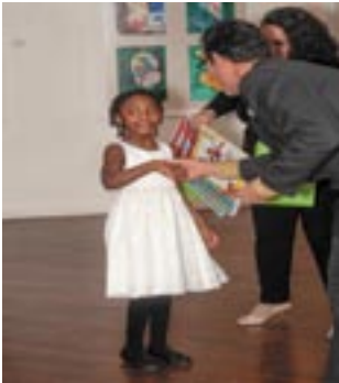
Young artist beams as she receives award