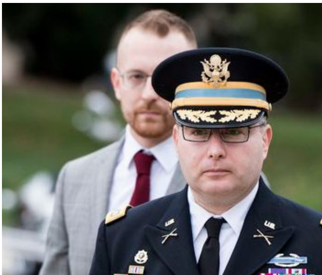
Alexander Vindman arrives to testify to the House Committee in full military dress.