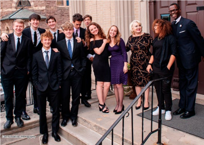
Members of the NJPAC/Wells Fargo Jazz for Kids Orchestra, take a well-deserved break during the Ed Berger: Jazz Photographer Exhibit.

T he Jewish Museum of New Jersey (JMNJ) launched its 2019-2020 season with the official opening of the Ed Berger: Jazz Photographer Exhibit. Ed Berger was an educator; author; Jazz aficionado;