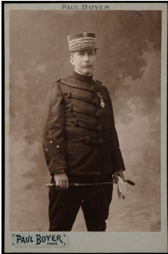
Georges Picquart, head of France's counter espionage discovered evidence clearing Dreyfus; but was thwarted by corrupt army officials.

testified before House Intelligence, Foreign Affairs and Oversight committees, regarding a mid-summer call between Donald Trump and Volodymyr Zelensky, president of Ukraine, that has become the nucleus of an impeachment probe of the President. Trump, who claims the call was "perfect," labeled the entire process a "sham" and a "political witch hunt."