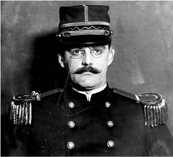
Alfred Dreyfus was convicted of treason in 1859

wasn't alone in its frenzy to spin Vindman's testimony into a scene out of The Manchurian Candidate . Sean Duffy, former Rep and newly hired CNN commentator found it necessary to raise Vindman's origins as a potential issue. When CNN host, John Berman questioned him on the relevance of Vindman's place of birth; Duffy replied, "It seems very clear that he is incredibly concerned about Ukrainian defense," Duffy said. "I don't know that he's concerned about American policy, but his main mission was to ensure that the Ukraine got those weapons. We all have an affinity to our homeland where we came from." He then doubled down on his position by adding, "He has an affinity for the Ukraine, He speaks Ukrainian. He came from the country." For his part Vindman said he decided to testify out of a "sense of duty." on the first day of testimony Vindman opened with, "I am a patriot, and it is my sacred duty and honor to advance and defend our country irrespective of party or politics." (That is a good thing...right?)