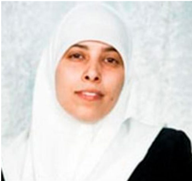
Hamas terrorist Ahlam Tamimi

(November 7, 2019 / JNS) T he United States has rejected a claim by Jordan over its refusal to deport wanted Palestinian-Jordanian Hamas terrorist Ahlam Tamimi, as a Jordanian court ruled in 2017 that Amman's extradition treaty with Washington is invalid, despite the U.S. State Department saying the opposite in a report published this week.